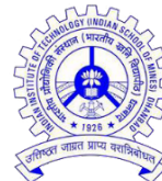
IIT (ISM) Dhanbad